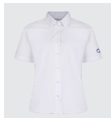
Twin Pack Shirt or Blouses