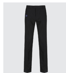
Trousers or Skirt